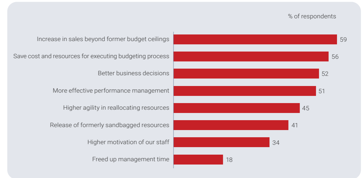
Figure 1: Survey on Beyond Budgeting Conducted by Boston Consulting Group

Bain surveyed its clients, finding that leading firms in financial planning are much more likely to have adopted the Beyond Budgeting principles. There was a massive difference across most principles, both in leadership and management processes.